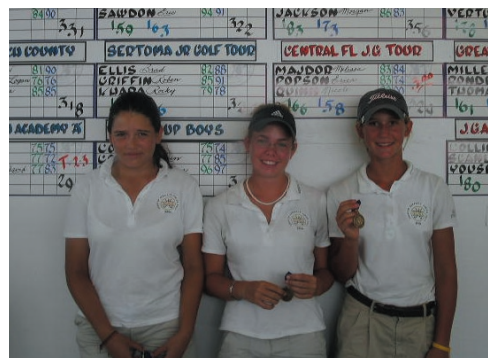
Greater Sarasota Jr Golf Assoc., girls 13-15 winners