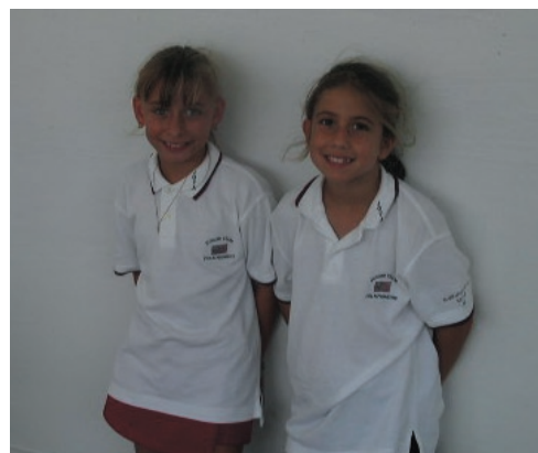
Future competitors of the Junior Team