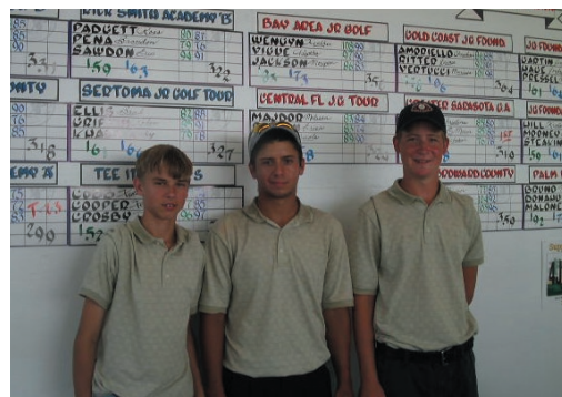
Junior Golf Association of Broward County, boys 13-15 division winners