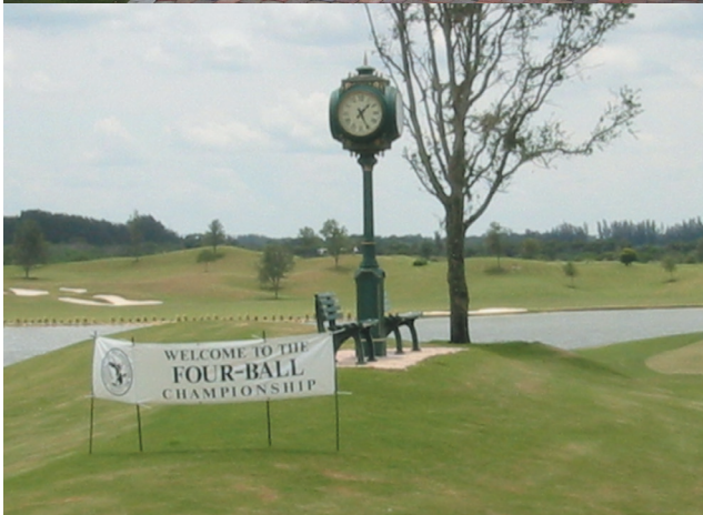
Quail Valley is a remarkable course designed by Fazio and Price.