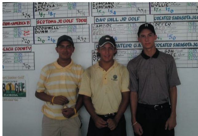
The Dade Amateur Golf Association, boys 16-18 age division winners

In this 36-hole stroke play competition the total of the low two of the three gross scores count for each round. This event is open to junior programs that provide organized tournaments, instruction or clinics which are open to all junior golfers in the community. The boys 16-18 age division played the Plantation's Bobcat course from approximately 6600 yards and the girls 16-18 division played the same course at 6000 yards. The boys 13-15 age division competed on the Panther course from 6400 yards as the girls 13-15 played from approximately 5800 yards out.