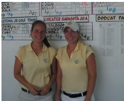
The girls 16-18 division winners from the Dade Amateur Golf Association